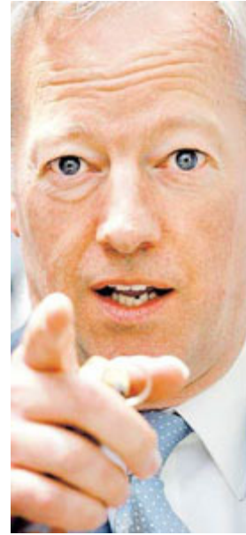
Sir Mark Thatcher